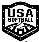
Allowed in all Slow Pitch, Men's and JO Boys Fast Pitch and Men's Modified Only