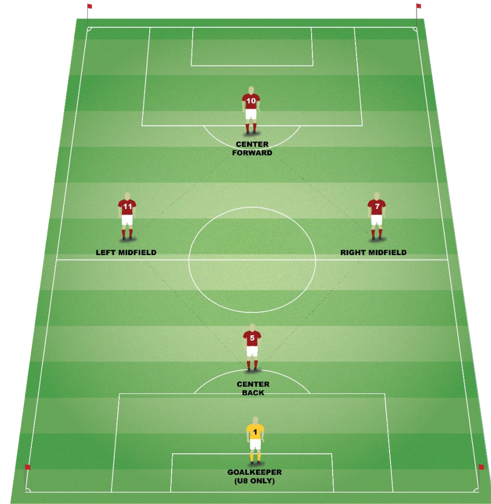
4V4 OR 5V5 1-2-1