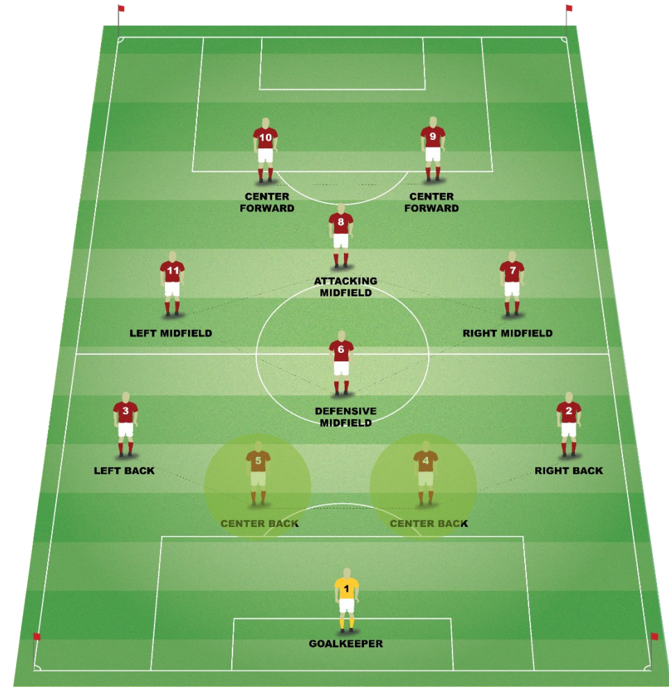
11V11 4-4-2 DIAMOND