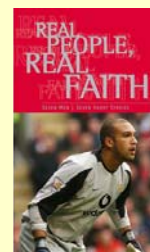
Each camper received a copy of the soccer booklet above