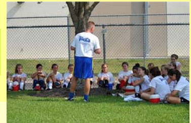
St. Agnes Academy Camp —Devotional time