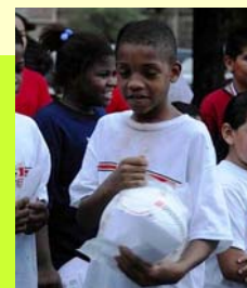
Campers receive their free soccer ball at the sponsored camp held at Springwoods Baptist Church (July 16-20)