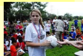
Campers receiving gifts at the end of each day