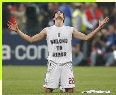
A.C. Milan star, Kaka, gives glory to God...!