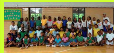
Sponsored Camp in Houston Heights (June 11-15)